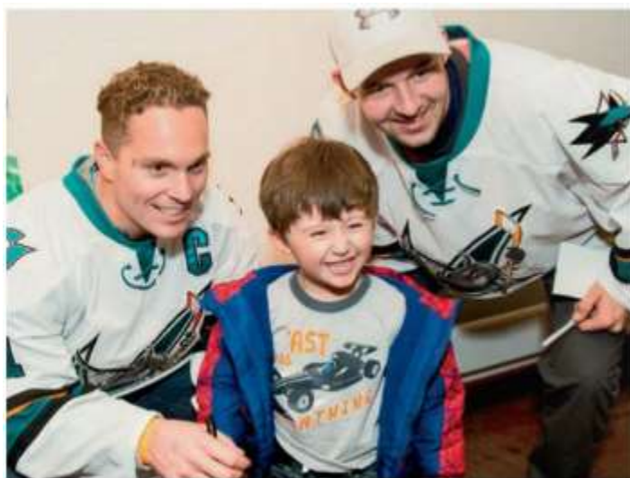
Meeting sports heroes at Holiday Heroes

Monday, December 5, 5:45 p.m. with VIP reception preceding at 4:30 p.m. AT&T Park, 24 Willie Mays Plaza. Tickets from $200. Wenderweiss.org ; holidayheroes.org/ticket-levels/